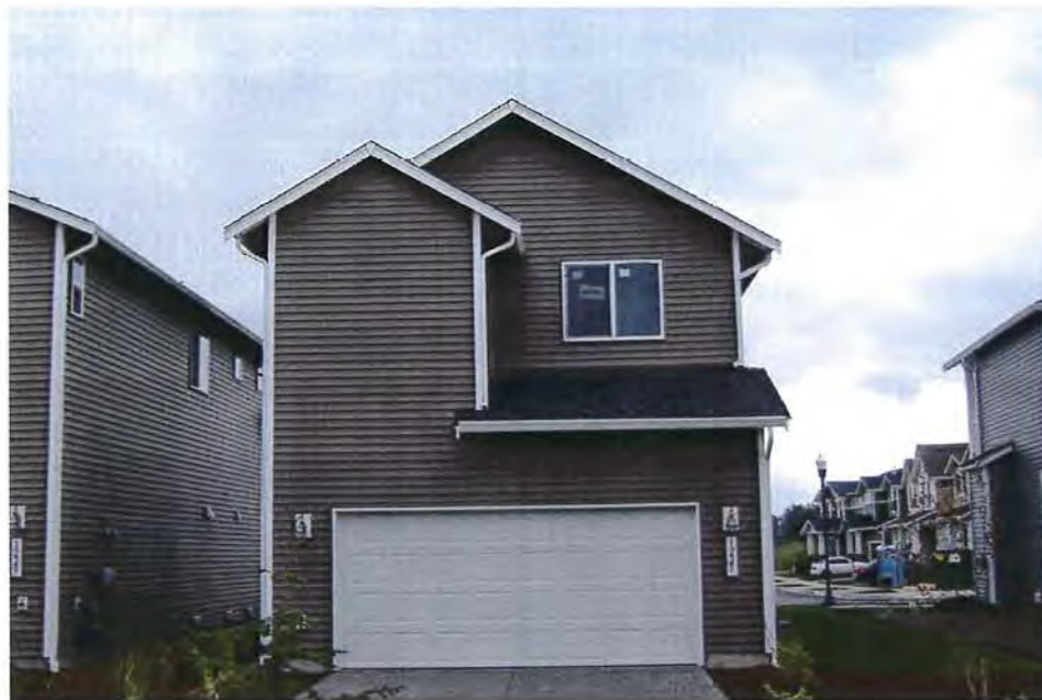
Lot 62 North Face 08-20-08

If submitting more photographs than will fit on the preceding page, affix the additional photographs below. Identify all photographs with: date taken; "Front View" and "Rear View"; and, if required, "Right Side View" and "Left Side View."