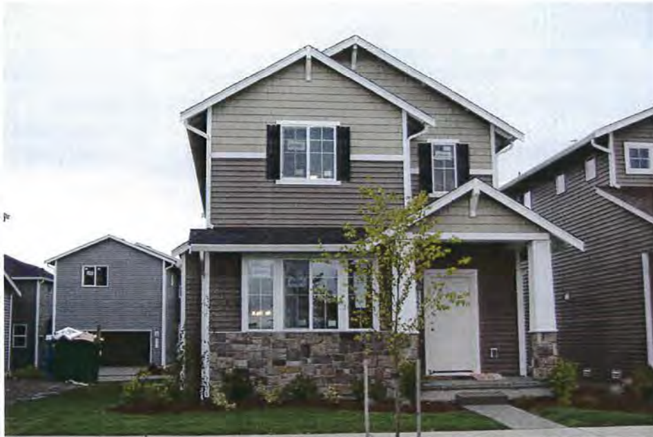
Lot 62 South Face 08-20-08

If using the Elevation Certificate to obtain NFIP flood insurance, affix at least two building photographs below according to the instructions for Item A6. Identify all photographs with: date taken; "Front View" and "Rear View"; and, if required, "Right Side View" and "Left Side View." If submitting more photographs than will fit on this page, use the Continuation Page, following.