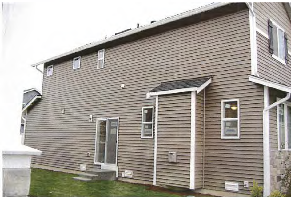
Lot 62 West Face 08-20-08