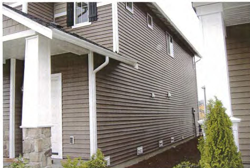
Lot 62 East Face 08-20-08